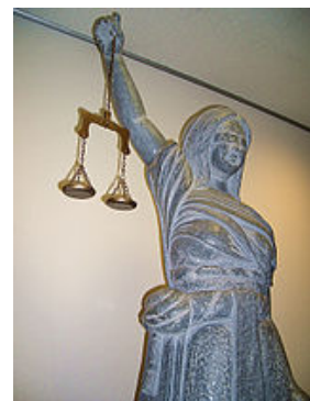
Figure 3: Sculpture outside court in Japan