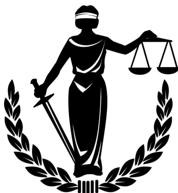
Figure 1: One symbol of Law and Justice